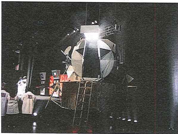
One of our newest exhibit pieces—a 90% scale model of the Lunar Excursion Module (LEM)!

Telescope nights are held periodically outside the museum. The viewings begin around 8pm (subject to weather) and guests are invited to view the night sky with our astronomy experts.